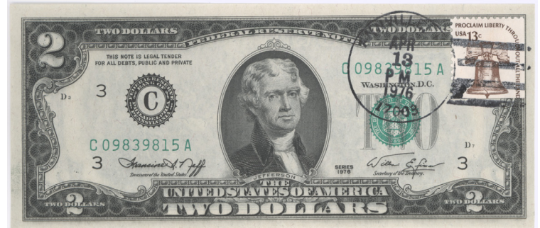
$2 First Day of Issue: 13¢ Liberty Bell tied to bill with hand cancellation, Anville, PA, 17003, April 13, PM, 1976.

I don't remember the face of the postmaster, but I do recall, fondly, that he didn't mind taking out all of his stamps when I asked, "What stamps do you have?" He would show me the definitives and the commemoratives. He was glad to sell me individual stamps, carefully separated from the