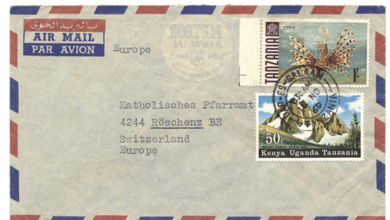
Dar-es-Salaam to Röschenz: TZS 1/50, air mail.

In my census, the air mail covers dated before the earlier cover are all franked TZS 1/30, while the covers dated after the later cover are