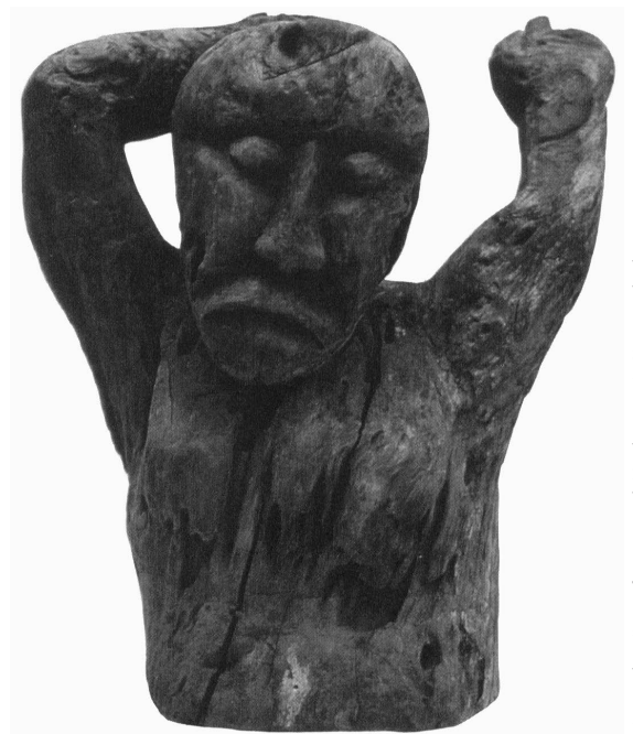
Wrestler: A 12" wood carving, undated, by Omari Mwariko, displays characteristics of the artist's approach to figures that find their echoes in the cachet sketch.