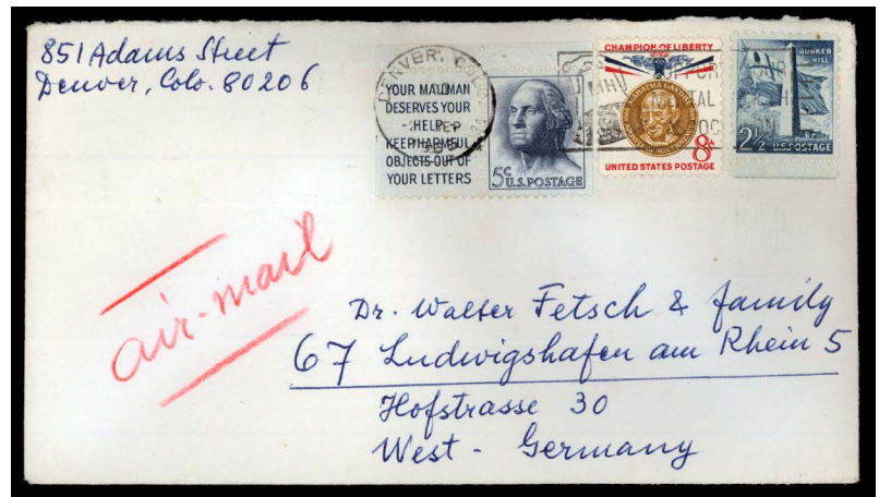
Last Champion of Liberty: The 8¢ Mahatma Gandhi issue of 1961.

So, the question is this: if the 8¢ Gandhi issue appeared on a letter four and two-thirds years after its release, was this an in-period usage? My first hunch was that the use occurred a bit long after release to be normal usage. Perhaps the letter was correspondence between