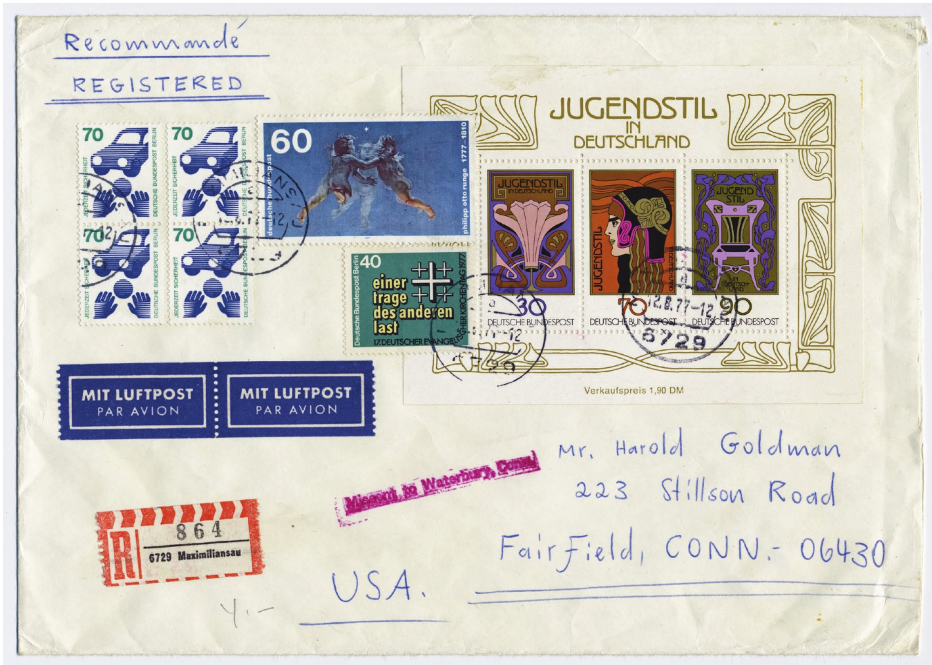
Cover: Author's collection

Maximiliansau, West Germany, to Fairfield, Connecticut, U.S.A.: Various West German definitive and commemorative issues, including a souvenir sheet highlighting German Art Nouveau design, paid DM 5.70 for a registered letter sent 12 August 1977. The magenta auxiliary marking on the front and the pair of circular date stamps on the back indicate the letter's detour to Waterbury, Connecticut.