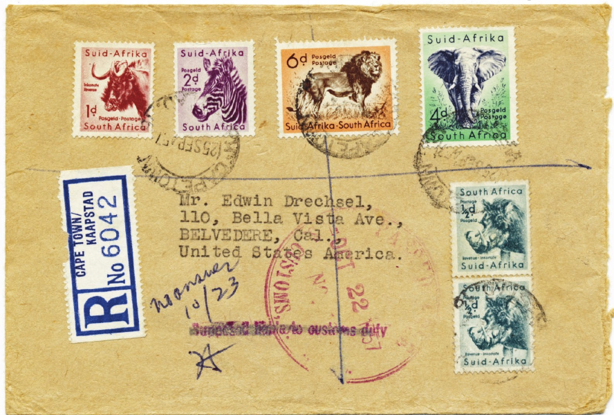
Capetown / Kaapstad to Belvedere: Six stamps, representing five different designs of South Africa’s 1954 definitive series, paid 14d for registered surface mail from Cape Town/Kaapstad to Belvedere, California. The combined rate for this letter was 13 1/2d. Thus, the letter was overpaid by 1/2d

The note, “No answer 10/23,” written in blue pen